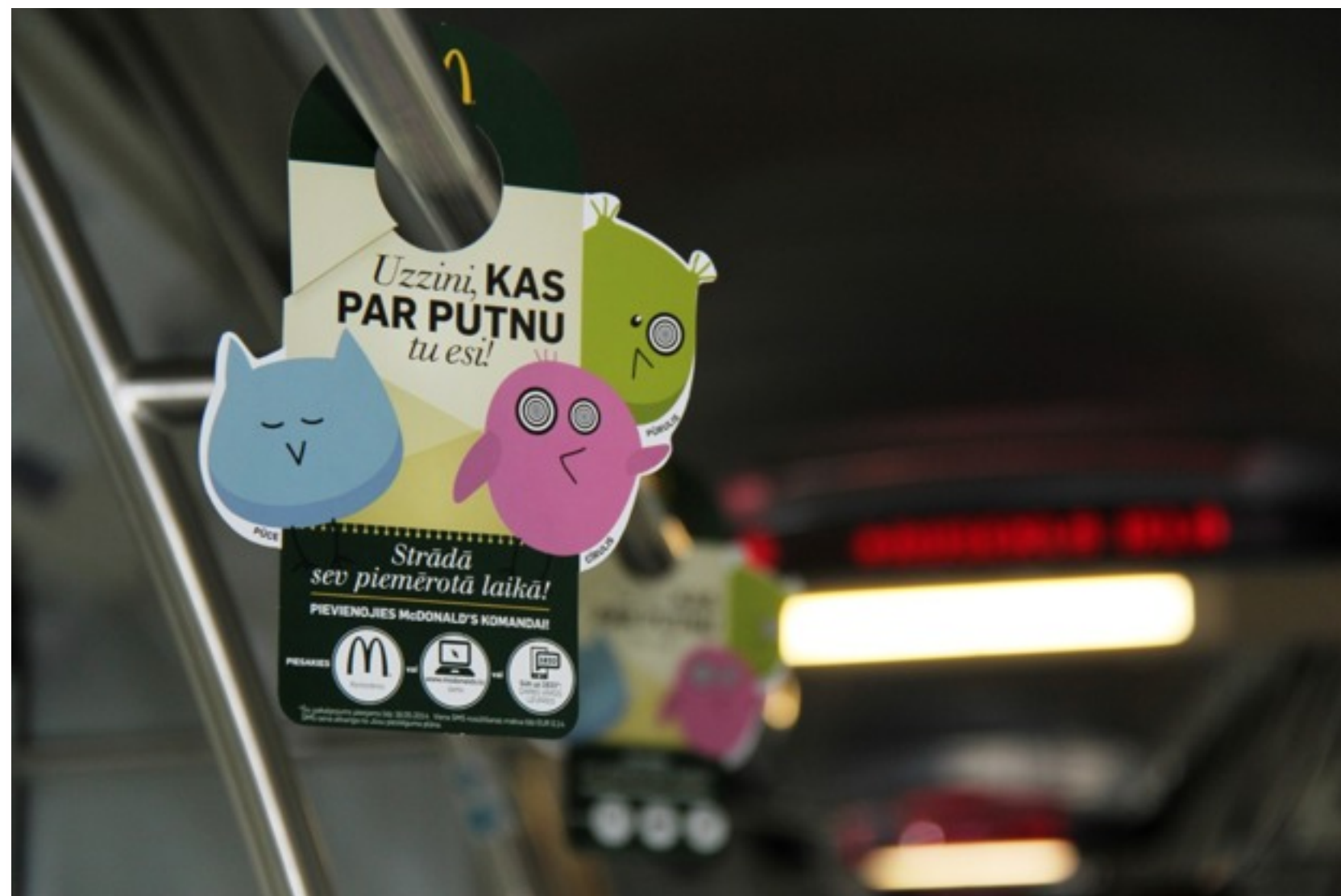
Hanger for the public transport