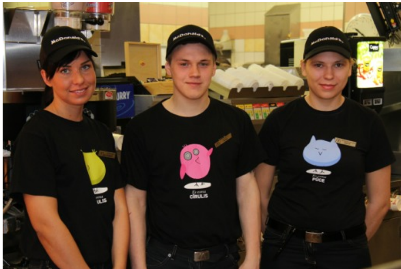
T-shirts for McDonald's staff members